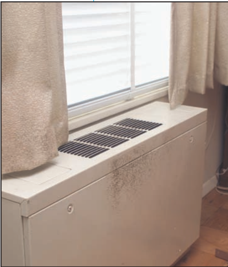
Mold growing on the surface of a unit ventilator.