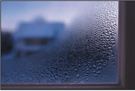
Condensation on the inside of a windowpane.