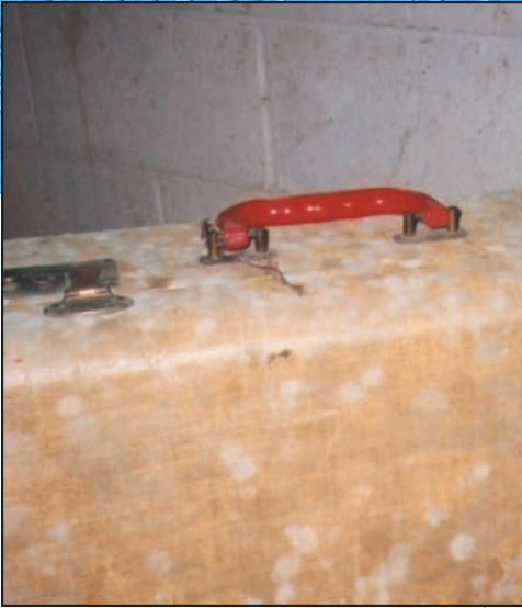
Mold growing on a suitcase stored in a humid basement.

It is important to take precautions to LIMIT YOUR EXPOSURE to mold and mold spores.