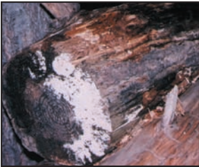
Mold growing outdoors on firewood. Molds come in many colors; both white and black molds are shown here.

Molds are part of the natural environment. Outdoors, molds play a part in nature by breaking down dead organic matter such as fallen leaves and dead trees, but indoors, mold growth should be avoided. Molds reproduce by means of tiny spores; the spores are invisible to the naked eye and float through outdoor and indoor air. Mold may begin growing indoors when mold spores land on surfaces that are wet. There are many types of mold, and none of them will grow without water or moisture.